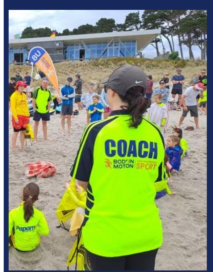
THANK YOU Body In Motion

A huge THANK YOU to our Junior Surf sponsors <u>Body In Motion</u> and <u>Mitre 10 Pāpāmoa</u>. We couldn't do this without you!!