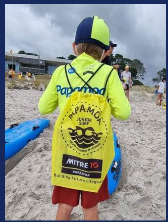
THANK YOU Mitre 10 Pāpāmoa

Have a safe and fun Christmas and please remember to always keep kids within arm's reach in the water and SWIM BETWEEN THE FLAGS