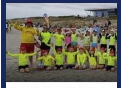
Papamoa SLSC Junior Surf